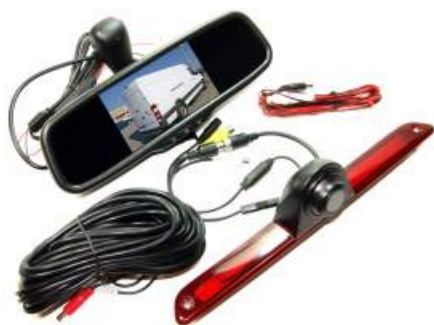
FM 5000SP Kit