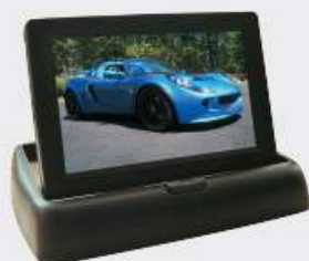
Dual mount flip-in 4.2" LCD monitor