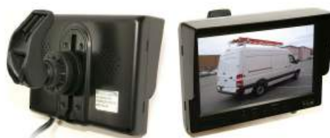
M6000-SP / M7000-SP