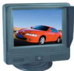
All new 3.5" digital touch-screen monitor