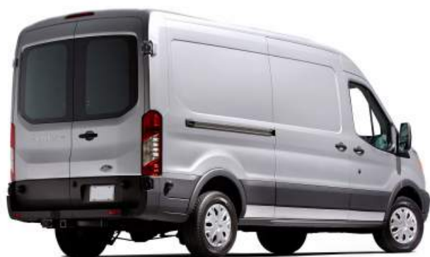
TransitCAM for FORD Transit Van