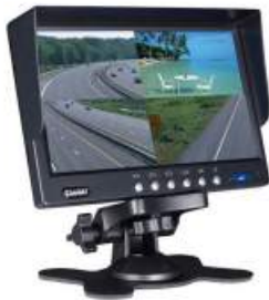
M6000 / M7000 / M7000QUAD