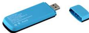
LTE portable router