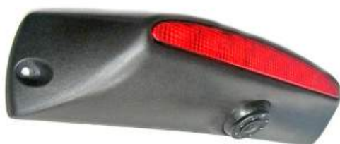
IVECO-CAM for IVECO Daily Van