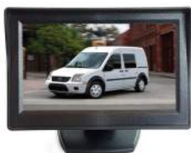
New 4.3" HD Universal monitor