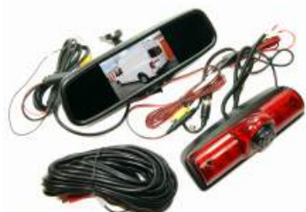
FM 5000-NV Kit