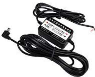
12V-24V to 5V power cable