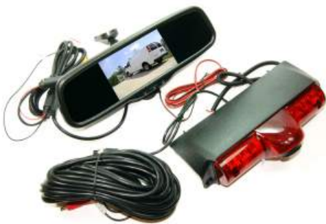
FM 5000-EP Kit